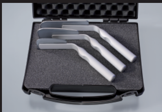
REF 6660 KO / empty