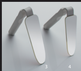
REF 6540 X ... / 6740 X ...