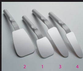
REF 6530 X ... / 6730 X ...