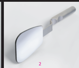
REF 6550 X ... / 6750 X ...

Photography Mirrors | for intraoral photos, front surface coated.